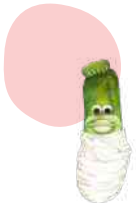
OZ die Zucchini