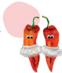
TRÖDEL & TAPS die Paprikas