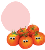
die WINZI- Tomaten