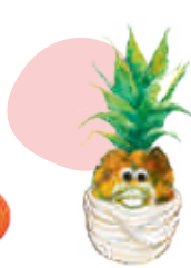
HULA die Ananas