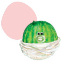
BABS die Wassermelone